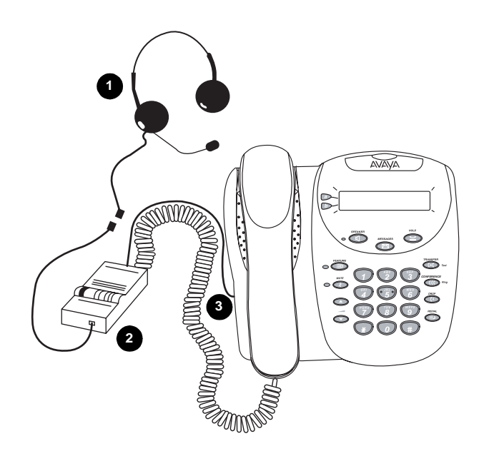
FIGURE 2 The Headset Attached to a 2402 Telephone

Headsets consist of a headpiece (1 in Figure 2 below) and modular base unit (2). The base unit plugs into the Handset jack (3).